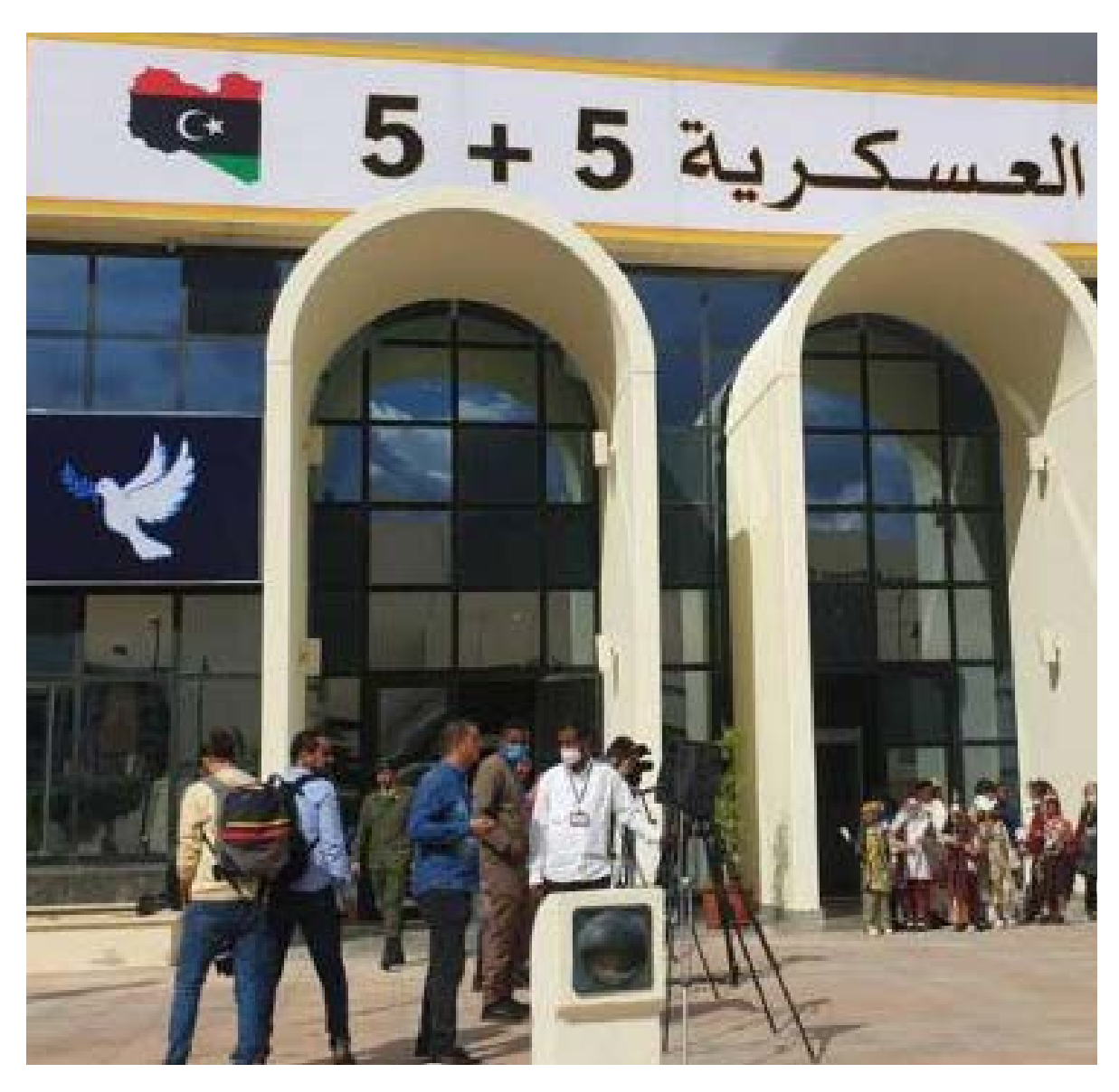
The 5+5 military commission headquarters in Sirte, Libya

personal protection. These forces are primarily led by Haftar's family who are bound to him through familial loyalty, and many of their <u>Salafi-Madkhali</u> forces under their control that are bound by a <u>fatwa</u> issued by a Saudi cleric demanding their loyalty to fight under Haftar's command. How will the military unification talk and implementation address the Pretorian guard? How will it reform each structure's discretely embedded ideological loyalty to either tribe, father or fatwa into a neutral military, loyal to a new unified state?