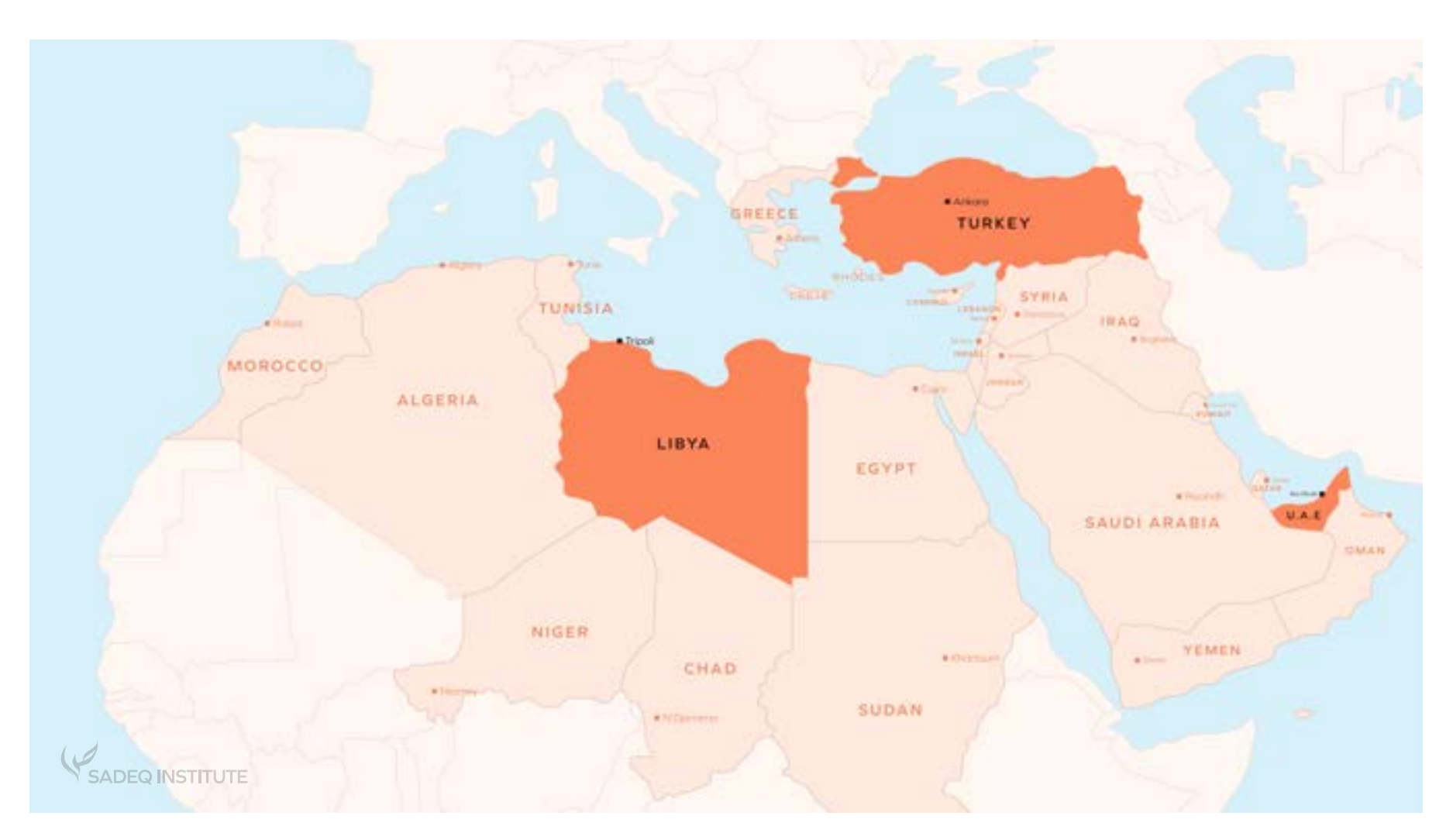
Turkey and UAE intervention within Libya